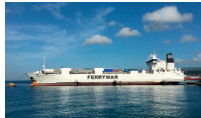
Hjorungavåg Verksted (Norway) Hull N°49 Delivery Sept. 1991