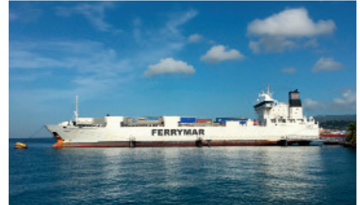
Hjorungavåg Verksted (Norway) Hull N°49 Delivery Sept. 1991