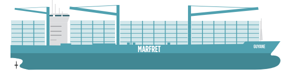
PORTE-CONTENEUR TYPE MARFRET GUYANE 2200 TEUS